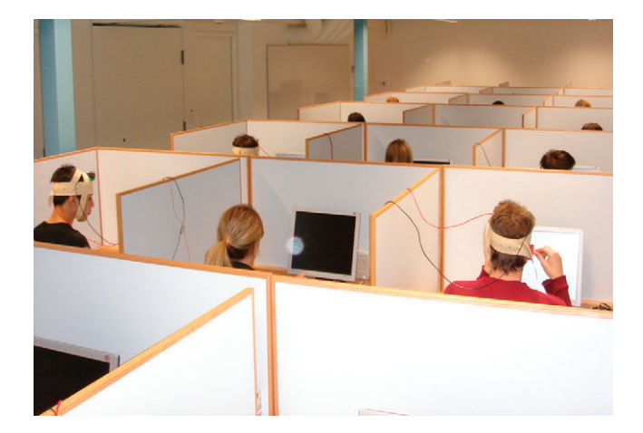
Figure 1. Experimental setting: 12 proposers and 6 responders were in the same laboratory during an experimental session. Responders received tDCS (placebo or cathodal stimulation over the right DLPFC), whereas experimenters sat between each pair of responders to control the tDCS devices.

We conducted the tDCS study with 128 subjects in the role of the proposer (no tDCS) and 64 subjects (all right-handed men) in the role of the responder who received either cathodal (i.e., excitability reducing) tDCS (n = 30) or placebo tDCS (n = 34) to the right DLPFC. During an experimental session (Fig. 1), 6 responders played 12 UGs each with 12 different, anonymous, proposers, that is, each responder "faced" any given proposer only once and was never informed of the bargaining partner's identity. We deliberately chose 1-shot interactions because no strategic spillovers across periods occur with this structure. This is particularly important if "true" preferences are to be elicited. We can therefore rule out the possibility that the observed rTMS effect is due to induced ignorance of possible reputational effects. The responders had to agree on the division of 20 Swiss Francs (CHF; CHF 1 \approx \in 0.65).